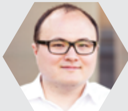
BEN PARR Award-Winning Journalist, Entrepreneur, Investor Author of "CAPTIVOLGY: THE SCIENCE OF CAPTURING PEOPLE'S ATTENTION"

Harness future insight. Secure your seat today @ GTX Ignite