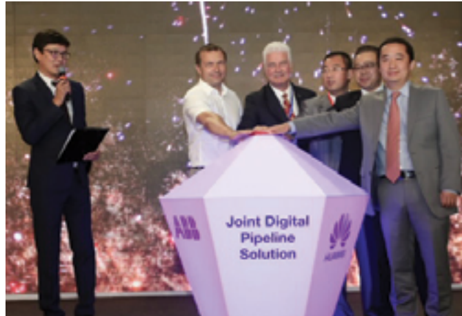
Huawei launches Joint Digital Pipeline Solution with Partners