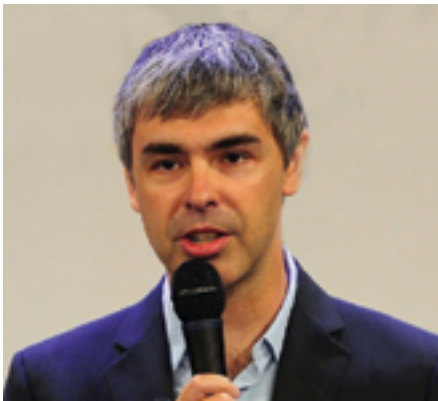
Larry Page, CEO - Alphabet

Alphabet becomes the umbrella organization for a slightly slimmed version of Google now a wholly owned subsidiary of Alphabet alongside other ventures into technology such as X Lab and Calico