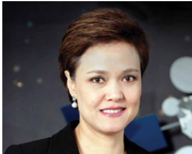
Suphaje Suthumpun, CEO - Thaicom

In the first half of 2015, consolidated revenue from sale of goods and rendering of services totaled Baht 6,013 million, increased by Baht 201 million or 3.5% from Baht 5,812 million Baht in the first half of 2014. Increased year-over-year revenue from satellite services, combined with significant growth in profit from investment in joint ventures, lead to consolidated net profit of Baht 1,112 million, up by 24.0% compared to the same period of 2014. There was also sizeable revenue growth generated from broadcasting services, with the number of television channels boarded on Thaicom's conventional satellite platform reaching 766 channels, in addition to growth in revenue realized