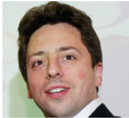
Sergey Brin, President - Alphabet