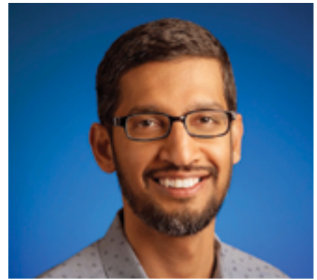
Sundar Pichai, new CEO - Google

Google has rebranded itself as Alphabet, a new umbrella company which will oversee eight firms, including the search engine Google. Larry Page and Sergey Brin announced the surprise move in a blog post. It means the firm will be able to lend more focus on risky ventures at its 'moonshot factory' Google X developing robots, self-driving cars and studying life sciences - while keeping investors happy.