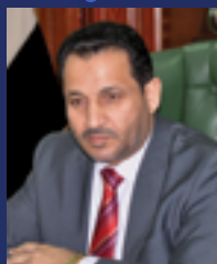
H.E. Hassan Al Rashid Minister of Communication Iraq Government