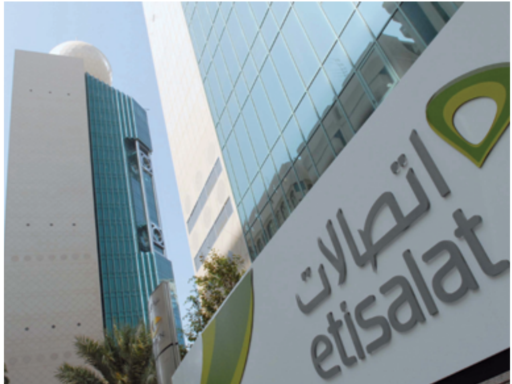
Etisalat Group Headquarters - UAE

At Etisalat Group, innovation remains at the heart of what we do and we are committed to being proactive in delivering for our customers. The accelerated rate of high tech development is at the heart of the pursuit of 5G. The migration of the bulk of media output from traditional mediums to the digital landscape has resulted in significant demands on the ICT sector, and telcos in particular. As video becomes almost entirely digital-driven, there will be an increased need for high-capacity data networks. Data already comprises 35 to 50 percent of the telecom